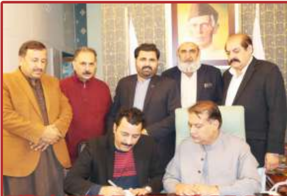
MOU Signing between (ICSTSI) and Terrace Grill