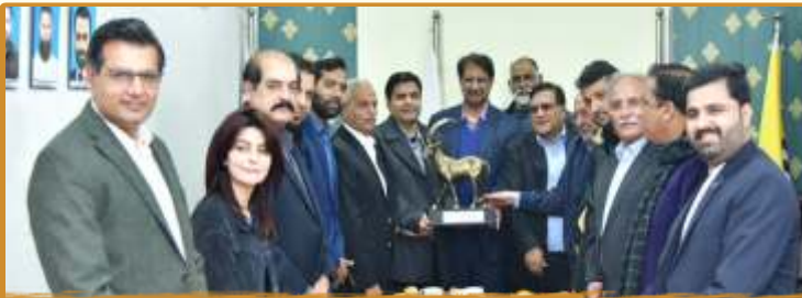
(ICCI) Team visited (ICSTSI) to congratulate newly elected office bearers (ICSTSI)