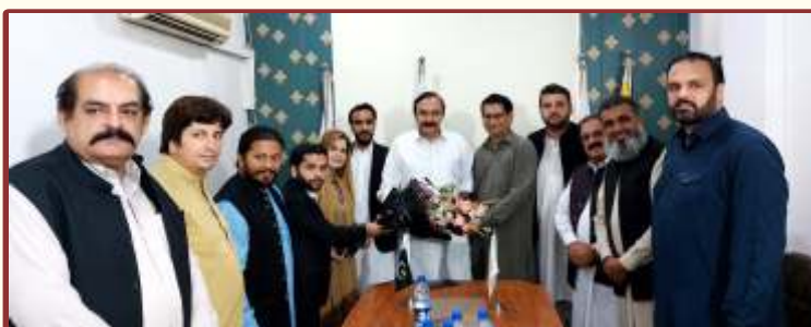
Tariq Fazal Chaudhry-Former Federal Minister