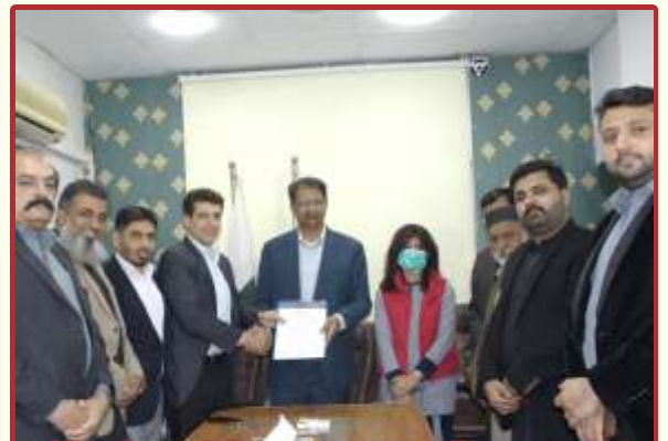
MOU between (ICSTSI) and Excel Lab