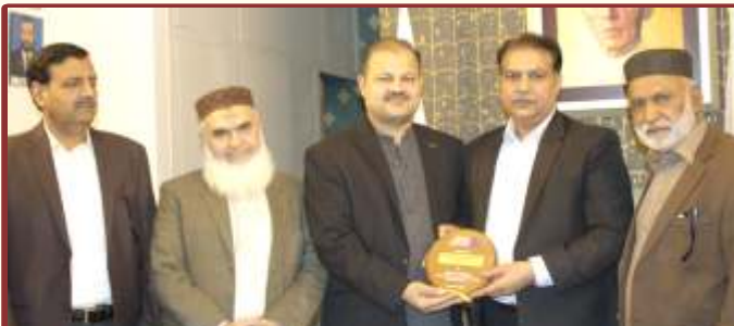
Islamabad Computers Association