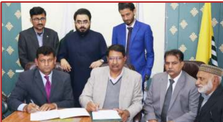
Health Net Lab Signing MOU with (ICSTSI)