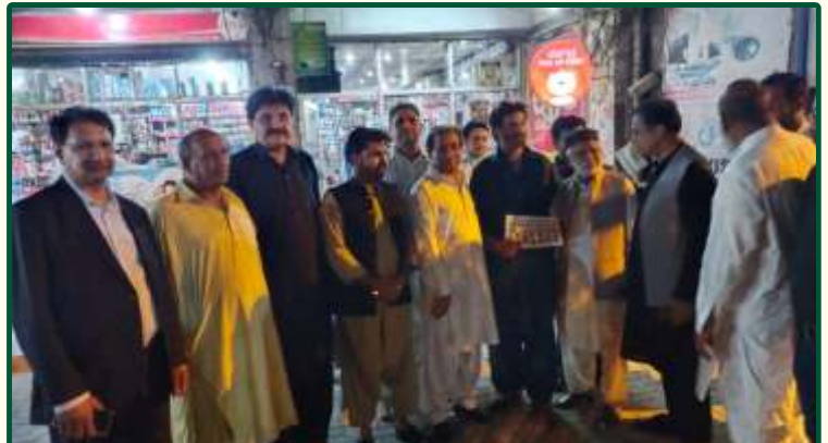
Blue Area Market