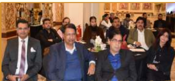
Team (ICSTSI) at 38th SAARC Charter Day