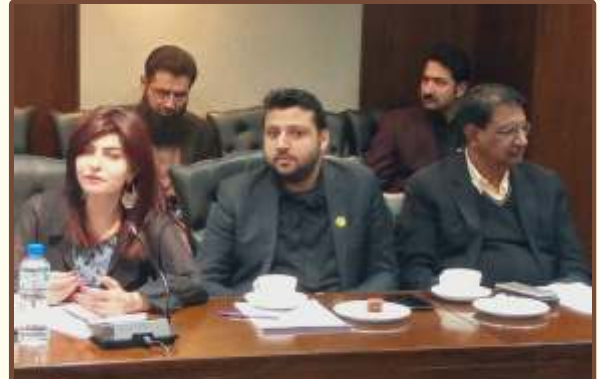
Team (ICSTSI) at (FPCCI) during visit of Ambassador of Turkey