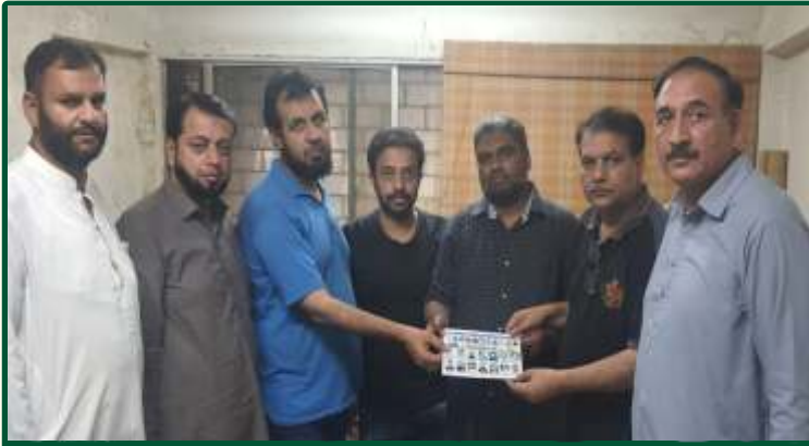
Blue Area Market