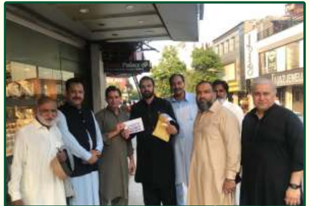
Jinnah Super Market