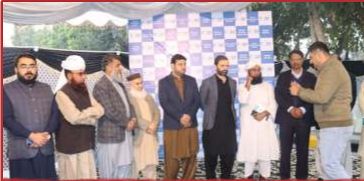
Blood Donation camp held by collaboration of Daawat-e-Islami and Computer Association of Islamabad