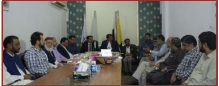
Blue Area Team paying congratulatory visit