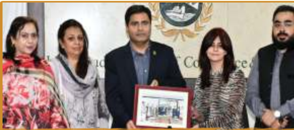
Team (ICSTSI) congratulating newly elected president (ICCI)