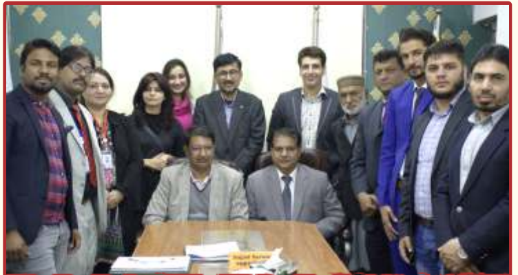
Health Care Professionals visiting (ICSTSI) office for signing of MOUs