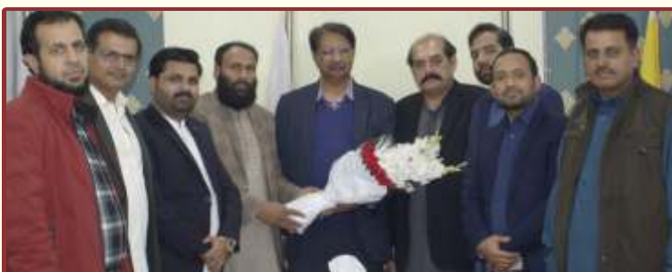
Milk and Dairy Association