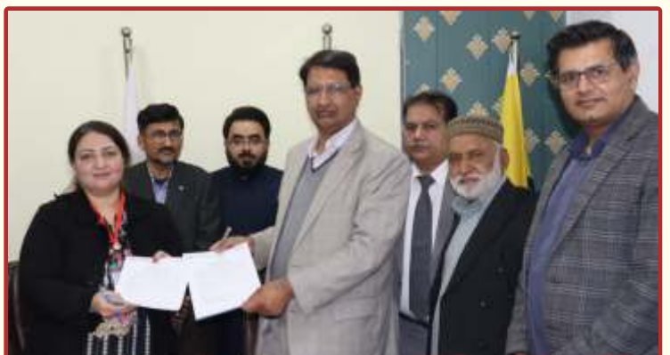
MOU Signing between (ICSTSI) and Premium Diagnostic