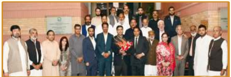
Teams (ICCI) and (ICSTSI) in group photo