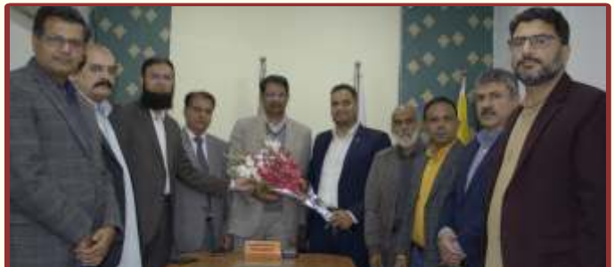
Islamabad Opticians Association