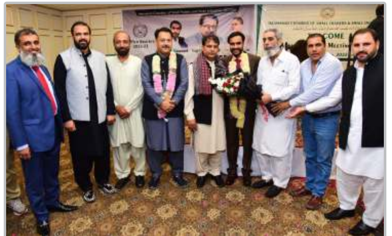
(ICSTSI) Team congratulating newly elected office bearers