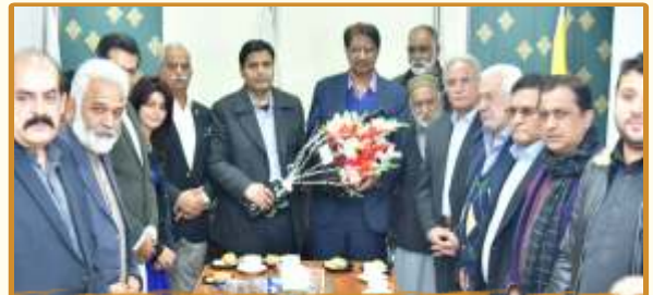
(ICCI) Team visited (ICSTSI) to congratulate newly elected office bearers (ICSTSI)