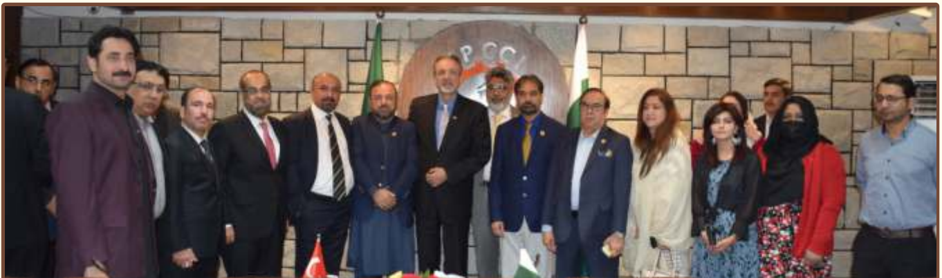
Team (ICSTSI) at FPCCI during visit of Ambassador of Turkey