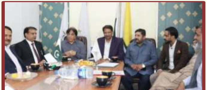
Hanif Abbasi-Advisor to PM & Chairman Metrobus Service