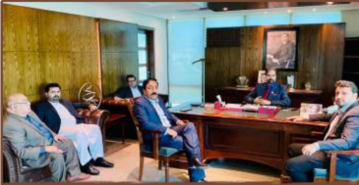
Team (ICSTSI) at (FPCCI) during visit of Ambassador of Turkmenistan