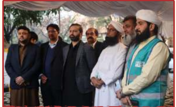
(ICSTSI) Participation at Blood Donation Camp